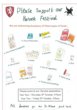
Promoting Harvest Festival

School Council has created a poster for each classroom to help us remember them as we believe these are five ways to help us have a great day!