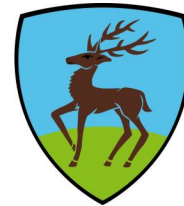
CYPRESS PRIMARY SCHOOL

Some of the children who attend Cypress speak another language at home. Small group and individual support is provided to these children, where appropriate, so that they can quickly develop their spoken and written English.